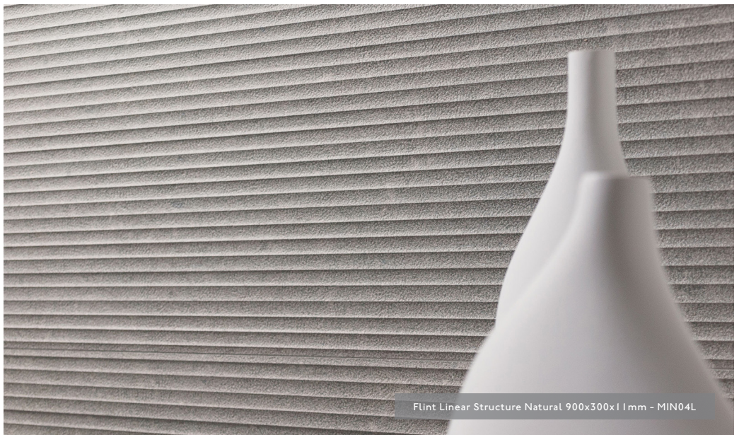
Flint Linear Structure Natural 900x300x11mm - MIN04L