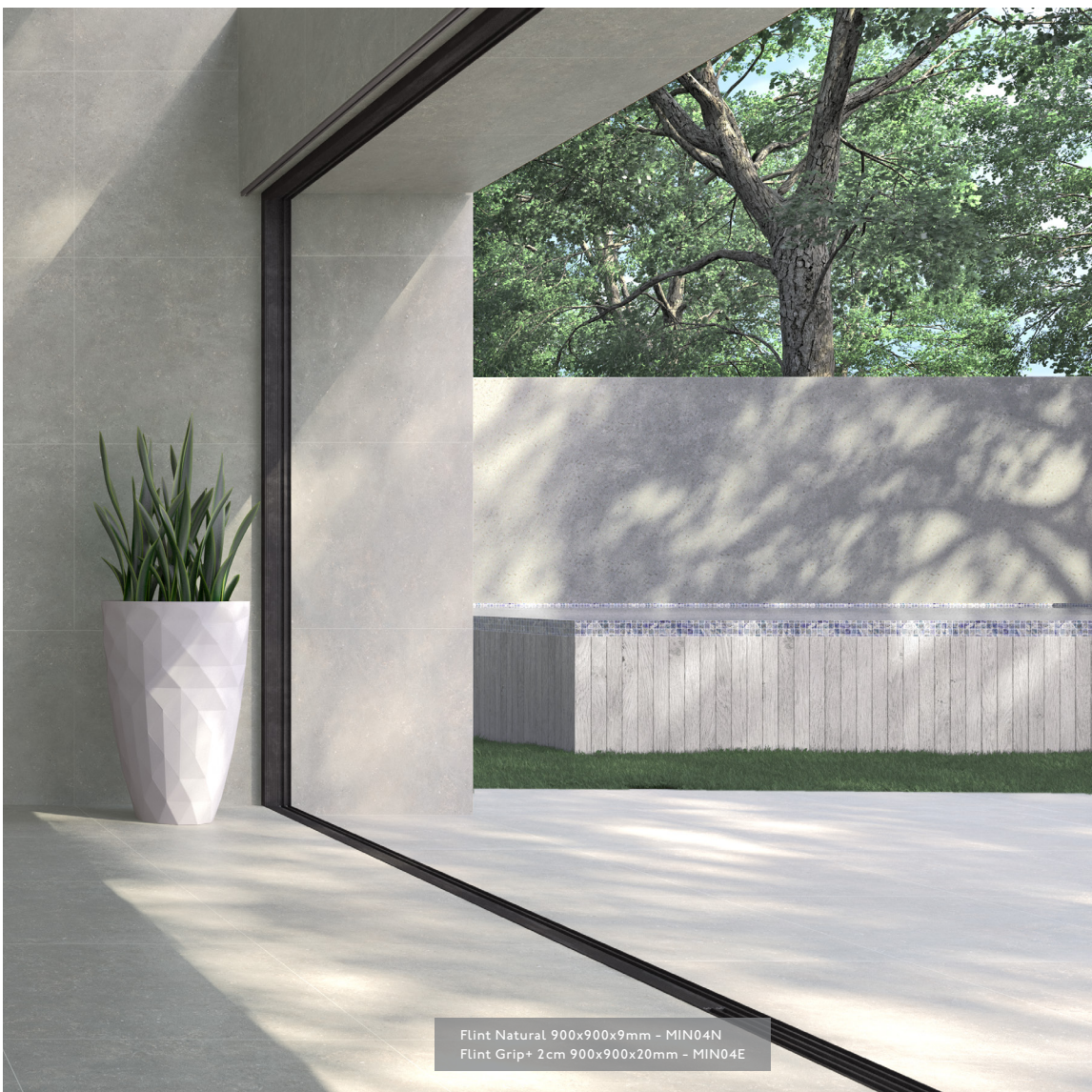
Flint Natural 900x900x9mm - MIN04N Flint Grip+ 2cm 900x900x20mm - MIN04E