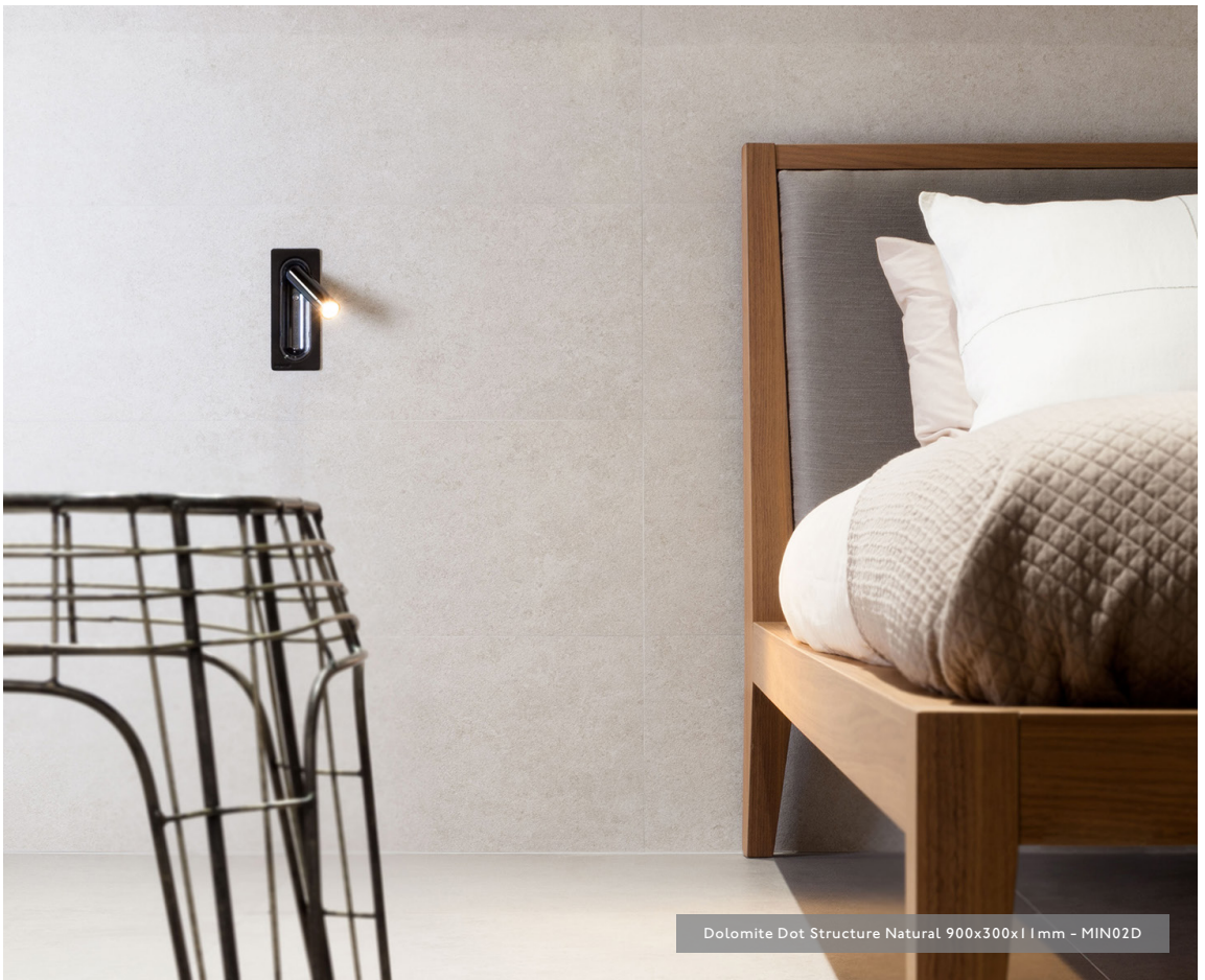
Dolomite Dot Structure Natural 900x300x11mm - MIN02D