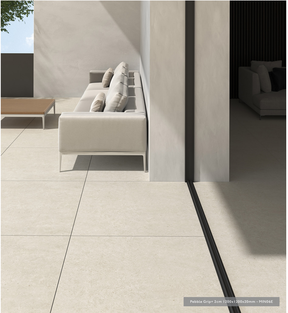
Pebble Grip+ 2cm | 200x1200x20mm - MIN06E