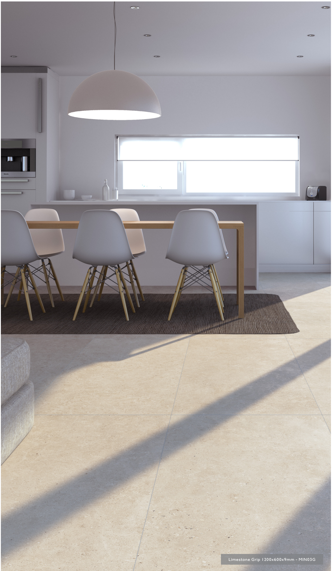
Limestone Grip 1200x600x9mm - MIN03G