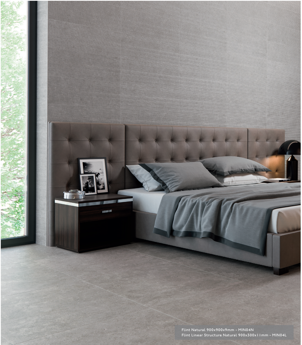
Flint Natural 900x900x9mm - MIN04N Flint Linear Structure Natural 900x300x11mm - MIN04L

The colours shown in this product overview are as accurate as printing processes will allow. Please refer to actual product samples before specifying. Every effort has been made to ensure the accuracy of the information given.