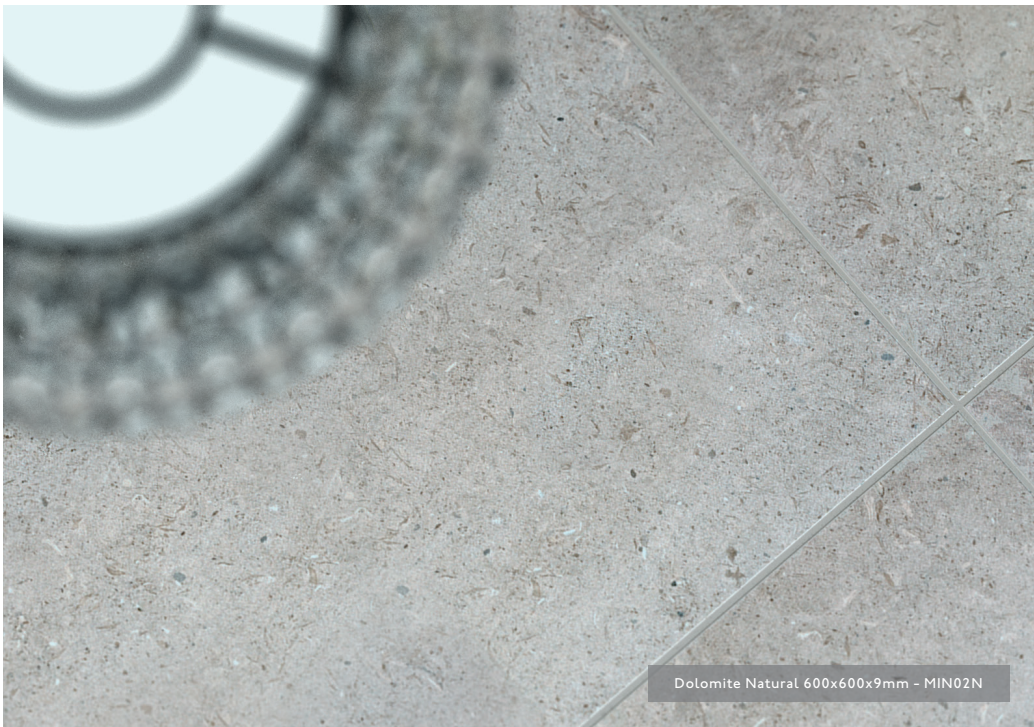
Dolomite Natural 600x600x9mm - MIN02N