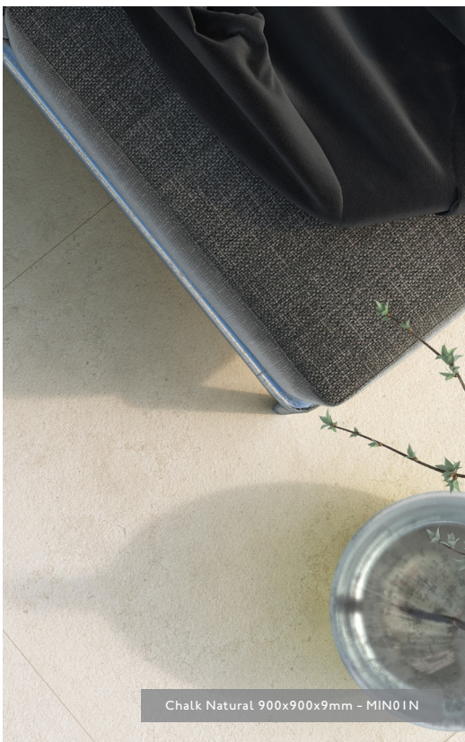
Chalk Natural 900x900x9mm - MIN01N