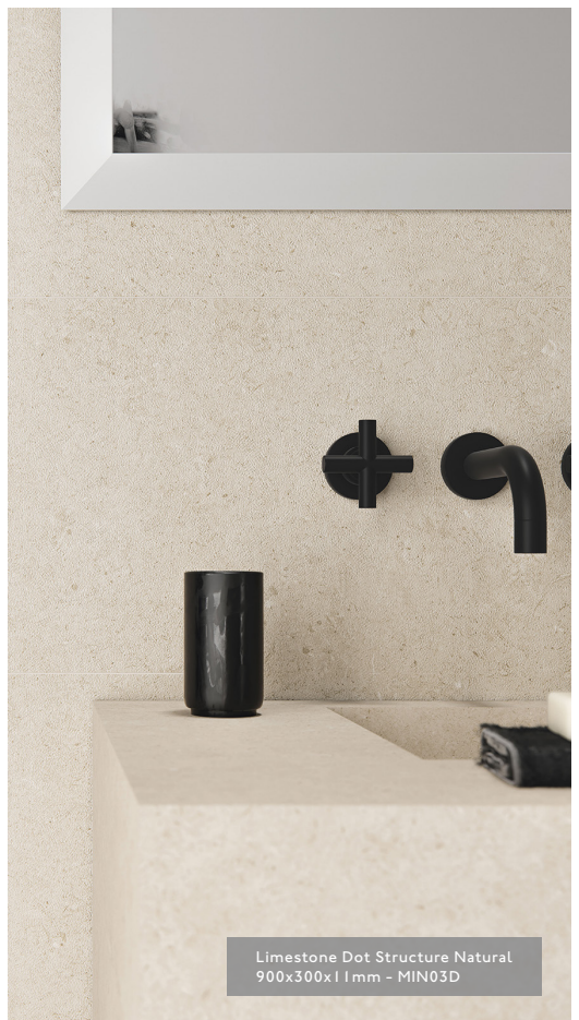
Limestone Dot Structure Natural 900x300x11mm - MIN03D