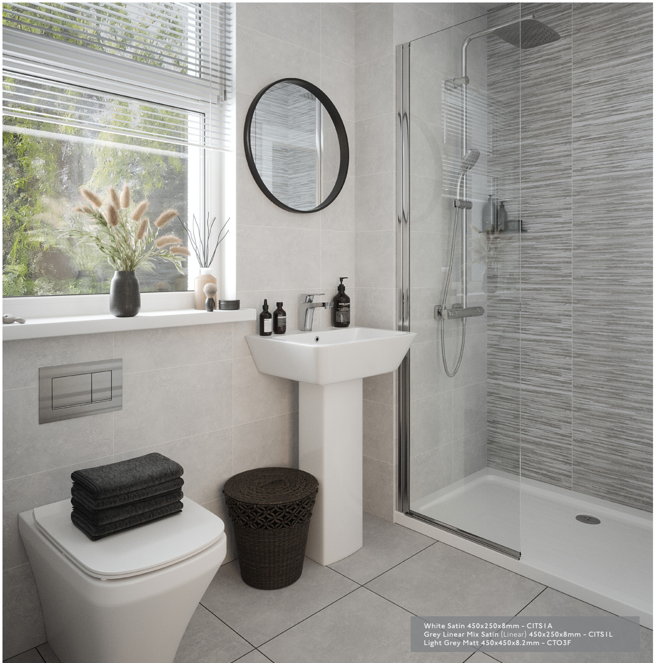
White Satin 450x250x8mm - CITS1A Grey Linear Mix Satin (Linear) 450x250x8mm - CITS1L Light Grey Matt 450x450x8.2mm - CTO3F

The colours shown in this range overview download are as accurate as printing processes will allow. Please refer to actual product samples before specifying. Every effort has been made to ensure the accuracy of the information given.