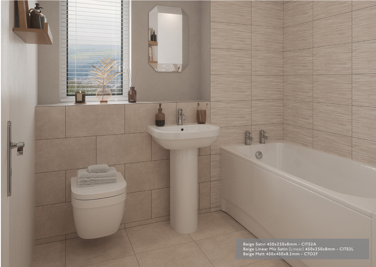
Beige Satin 450x250x8mm - CITS2A Beige Linear Mix Satin (Linear) 450x250x8mm - CITS2L Beige Matt 450x450x8.2mm - CTO2F