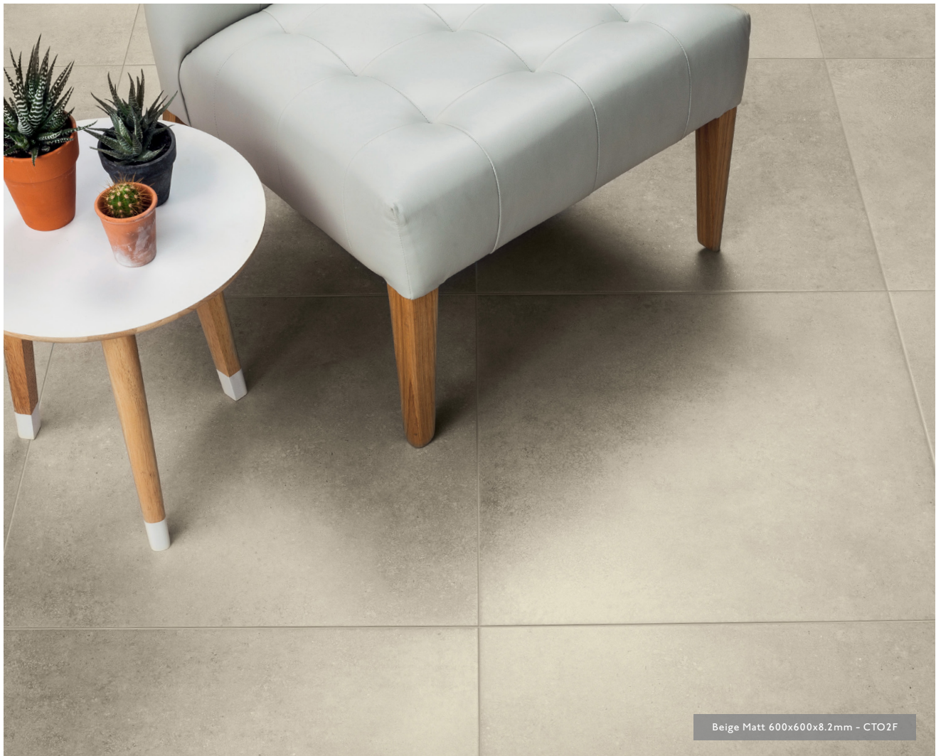
Beige Matt 600x600x8.2mm - CTO2F

Note: Class BIII: Glazed Ceramic Tiles, Class Bla: Glazed Porcelain Tiles. For more information please see the suitability advice given in the technical section. All sizes indicated are metric modular. ALL sizes shown are nominal. For the most up-to-date size, colour and finish availability, please visit our website - www.johnson-tiles.com .