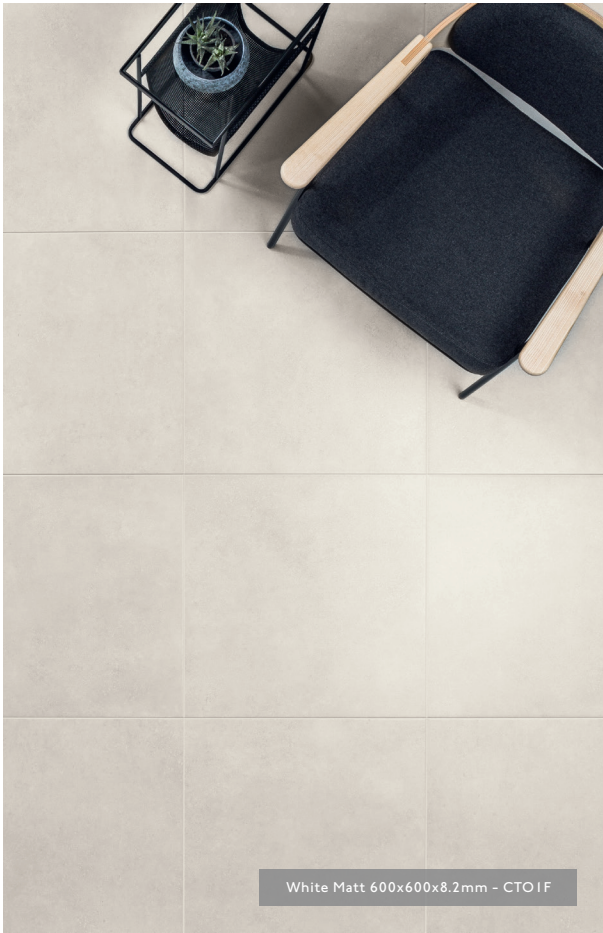
White Matt 600x600x8.2mm - CTO1F