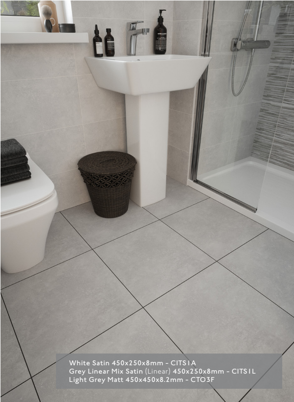
White Satin 450x250x8mm - CITS1A Grey Linear Mix Satin (Linear) 450x250x8mm - CITS1L Light Grey Matt 450x450x8.2mm - CTO3F