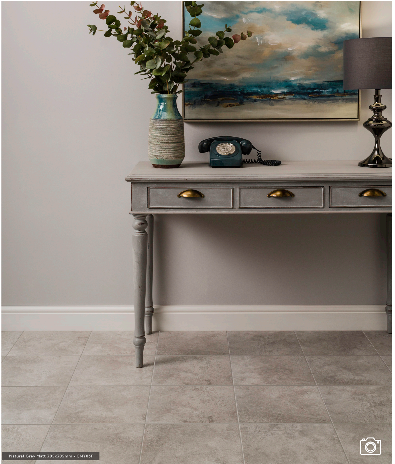
Natural Grey Matt 305x305mm - CNY03F

Front Cover Image: Old Stone Matt 300x200mm - CNY01A, Old Stone Wave Structure Matt 300x200mm - CNY01W & Old Stone Matt 305x305mm - CNY01F