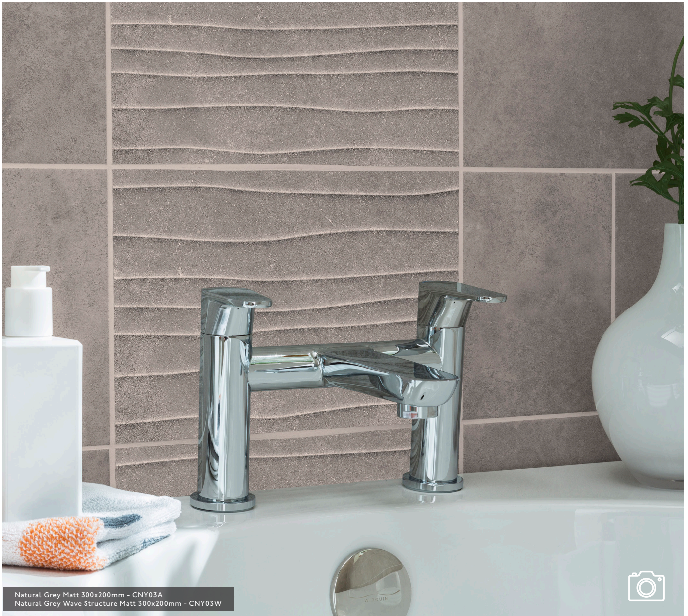
Natural Grey Matt 300x200mm - CNY03A Natural Grey Wave Structure Matt 300x200mm - CNY03W