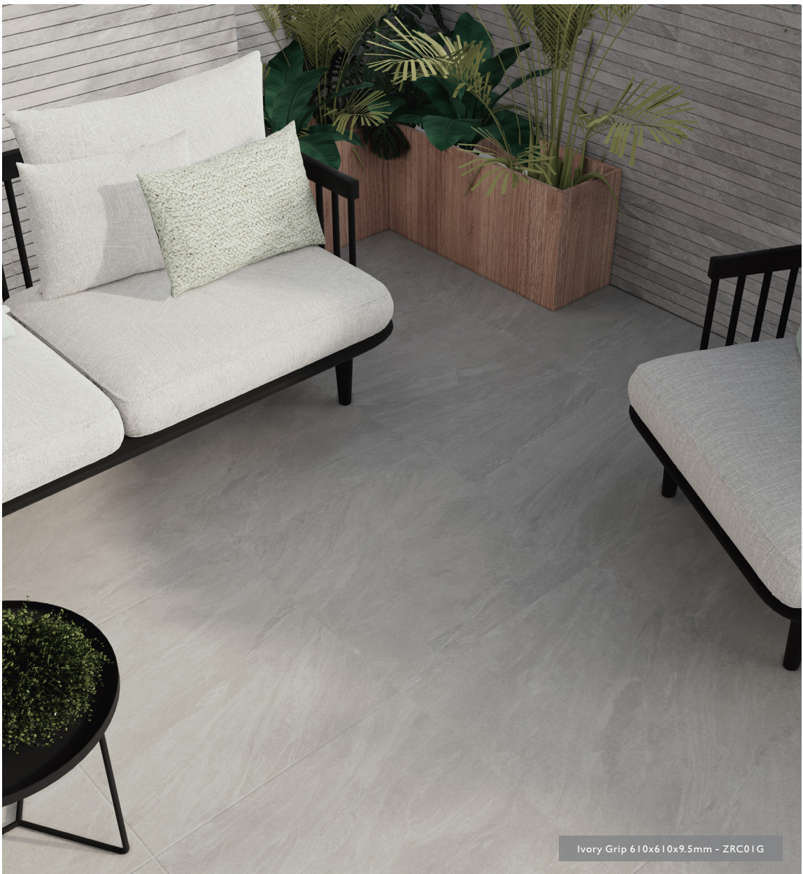
Ivory Grip 610x610x9.5mm - ZRC01G

Note: (R) Rectified Edge. Class Bla: Glazed Porcelain Tiles. For more information please see the suitability advice given in the technical section. All sizes indicated are metric modular. All sizes shown are nominal. For the most up-to-date size, colour and finish availability, please visit our website - www.johnson-tiles.com .