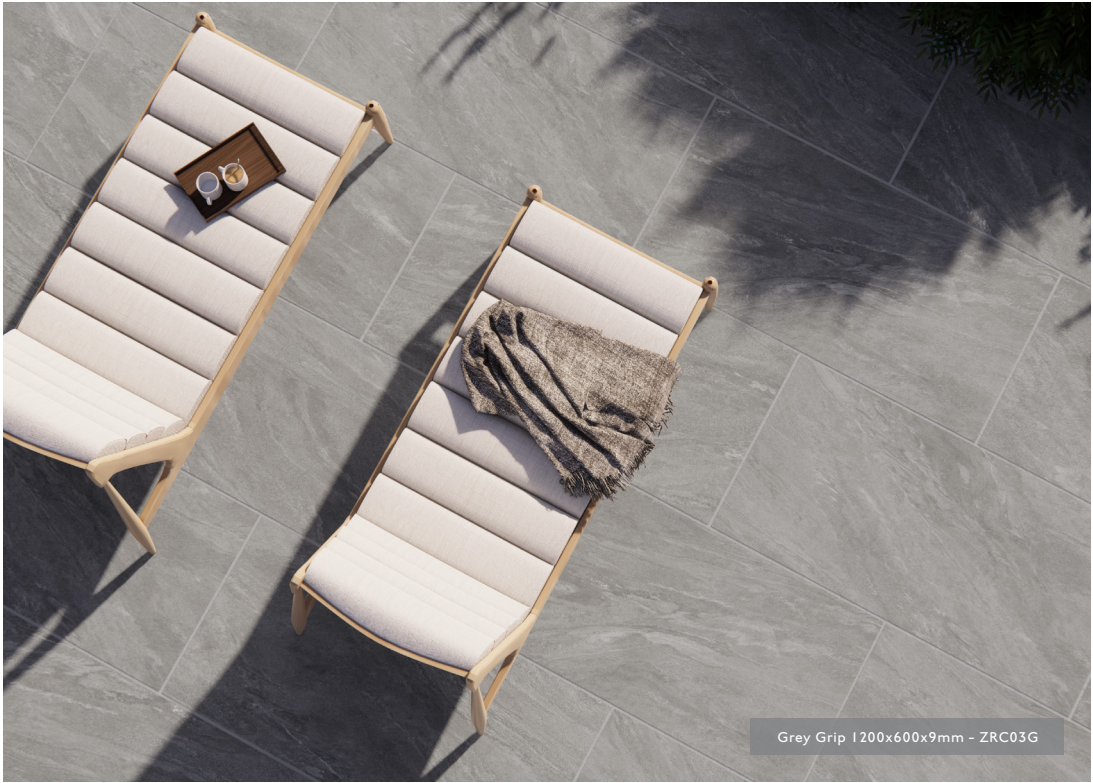
Grey Grip 1200x600x9mm - ZRC03G