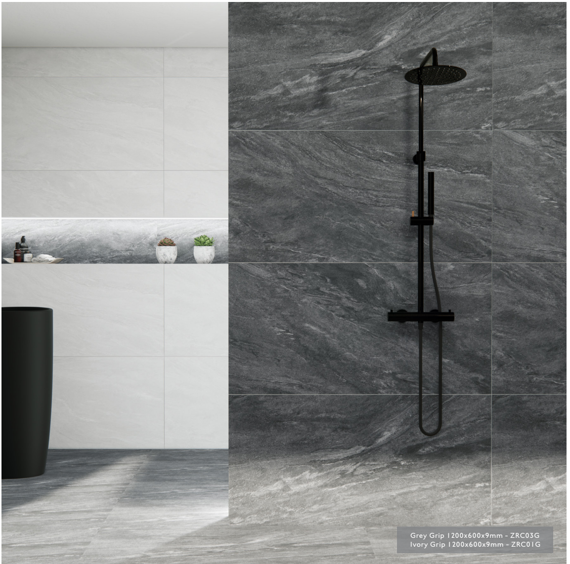
Grey Grip 1200x600x9mm - ZRC03G Ivory Grip 1200x600x9mm - ZRC01G