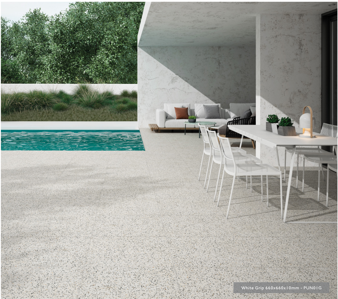
White Grip 660x660x10mm - PUN01G

Note: Class Bla: Glazed Porcelain Tiles. For more information please see the suitability advice given in the technical section. All sizes indicated are metric modular. All sizes shown are nominal. For the most up-to-date size, colour and finish availability, please visit our website - www.johnson-tiles.com .