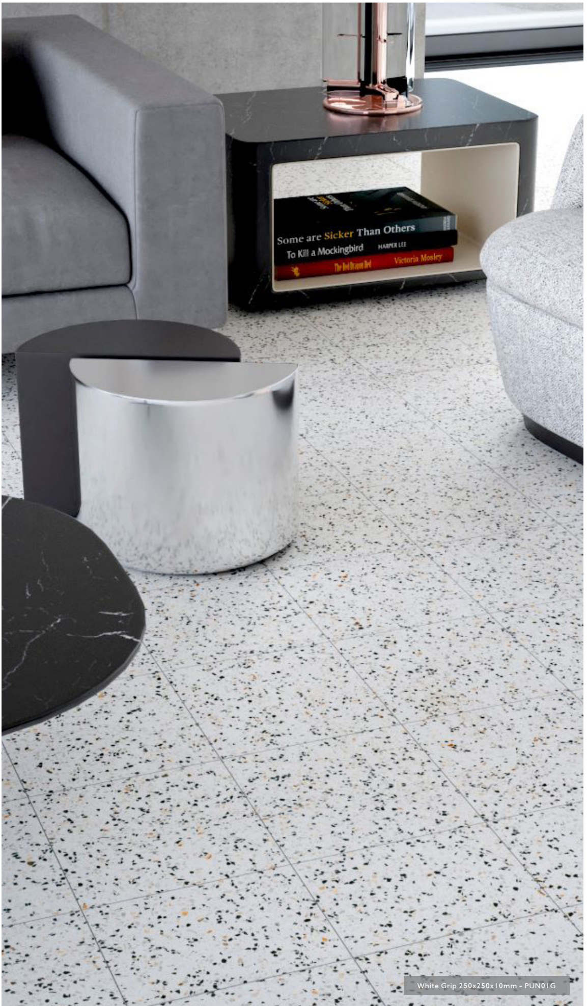
White Grip 250x250x10mm - PUN01G