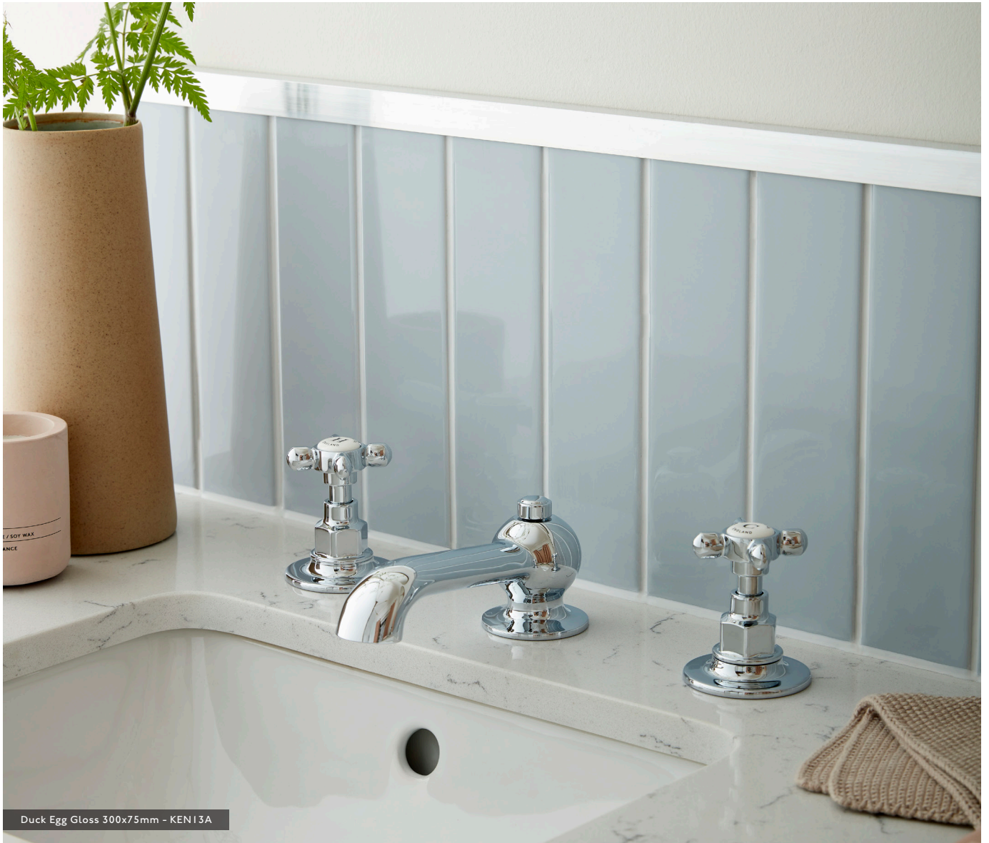
Duck Egg Gloss 300x75mm - KEN13A