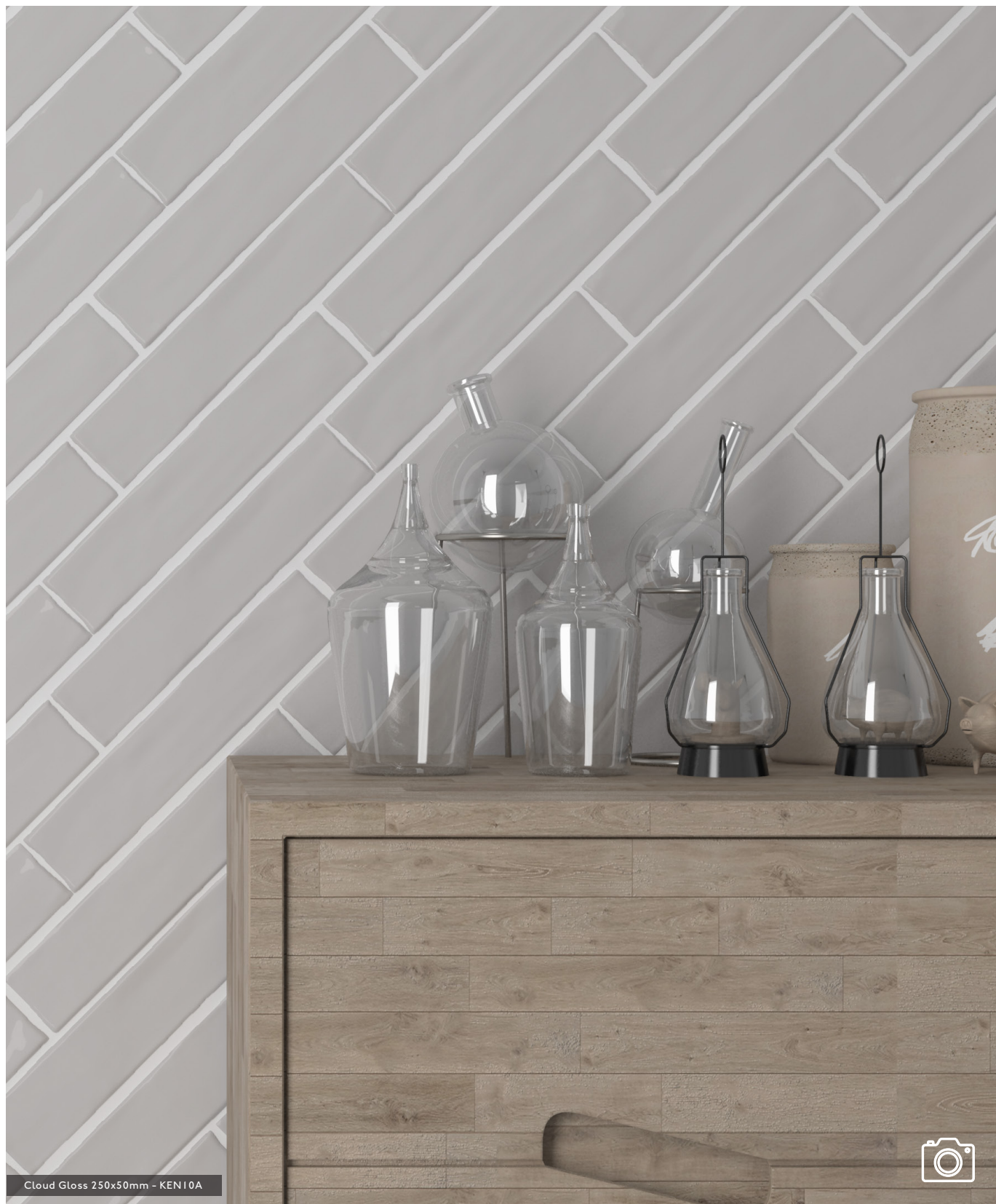
Cloud Gloss 250x50mm - KEN10A

Front Cover Image: Snow Gloss 250x50mm - KEN09A