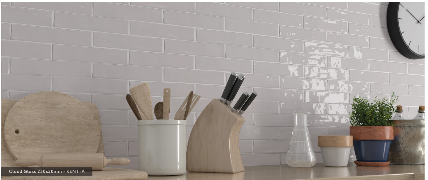
Cloud Gloss 250x50mm - KEN11A