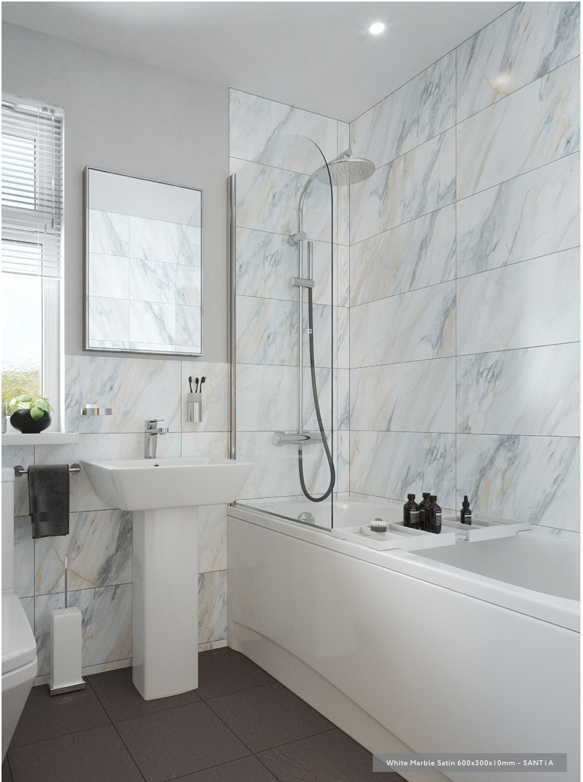
White Marble Satin 600x300x10mm - SANT1A

The surface is finished in a satin glaze, adding a touch of minimalistic charm to any setting