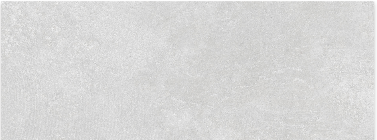
CLAY LRV: 55 PEI: IV Product Code - 450x450mm [BIIa]: M DRWNIF