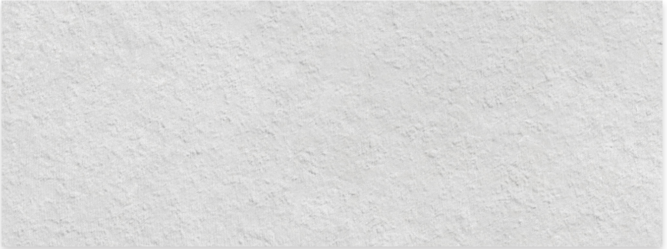
CLAY (Rockfall Structure) LRV: 55 Product Code - 450x250mm [BIII]: M DRWNIA