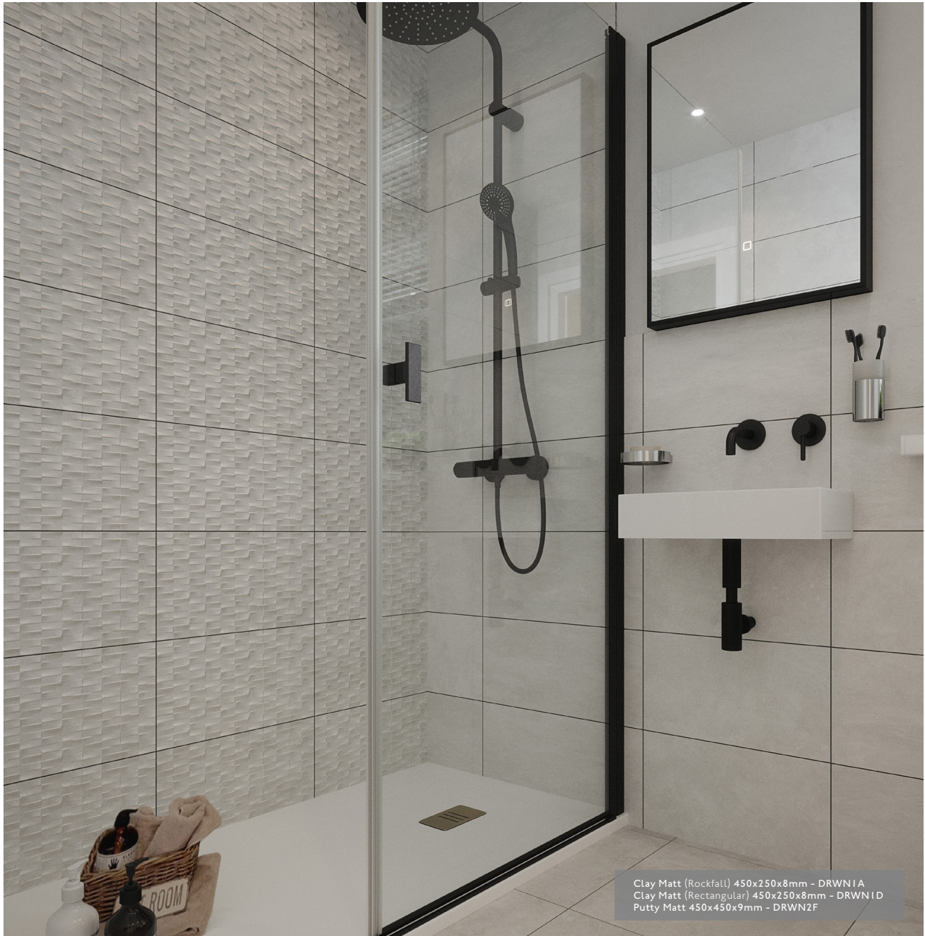
Clay Matt (Rockfall) 450x250x8mm - DRWN1A Clay Matt (Rectangular) 450x250x8mm - DRWN1D Putty Matt 450x450x9mm - DRWN2F

The colours shown in this range overview download are as accurate as printing processes will allow. Please refer to actual product samples before specifying. Every effort has been made to ensure the accuracy of the information given.