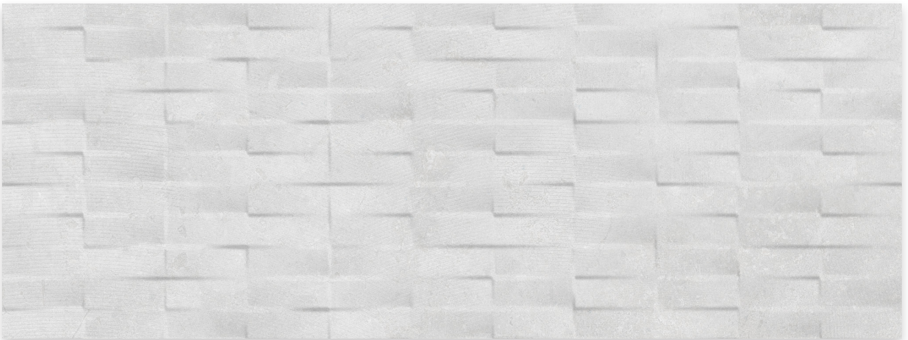
CLAY (Rectangular Structure) LRV: 55 Product Code - 450x250mm [BIII]: M DRWNID