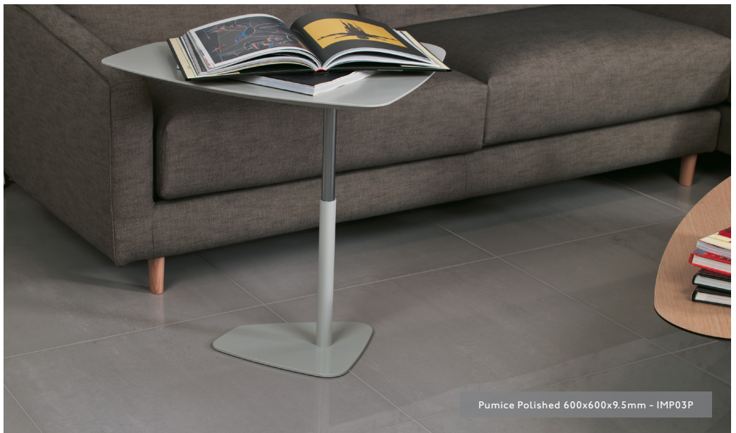
Pumice Polished 600x600x9.5mm - IMP03P