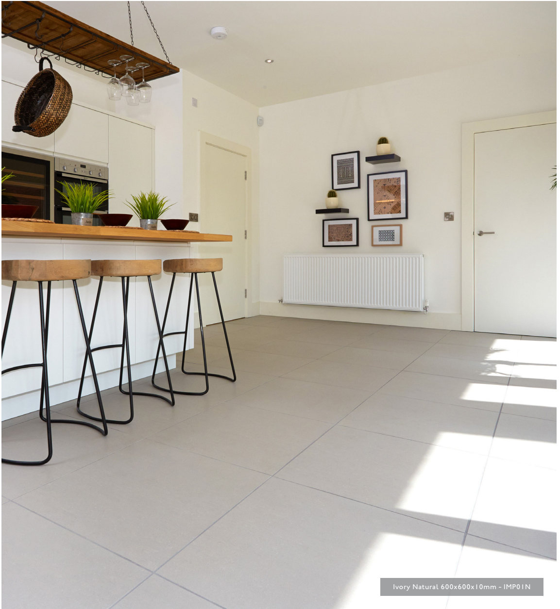
Ivory Natural 600x600x10mm - IMP01N