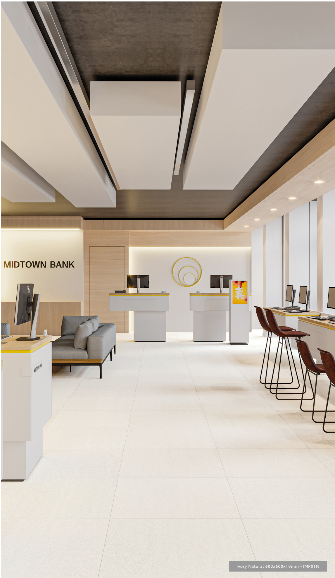
Ivory Natural 600x600x10mm - IMP01N